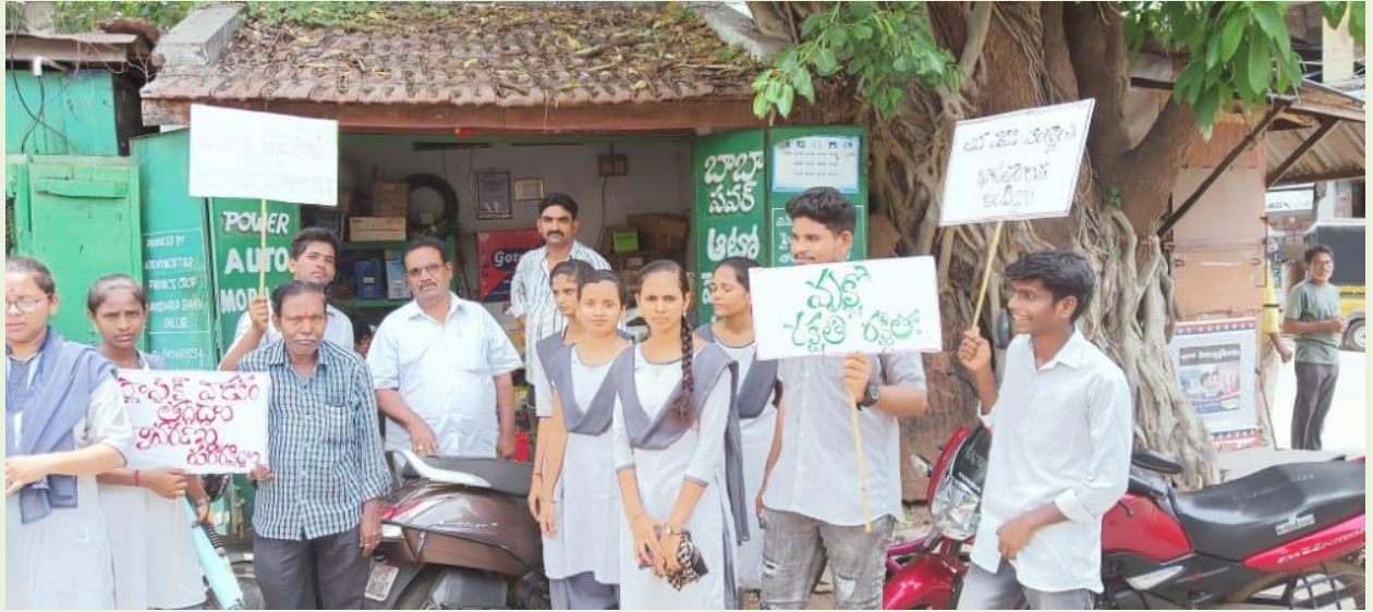
Environmental Awareness Programme on 05.06.2021