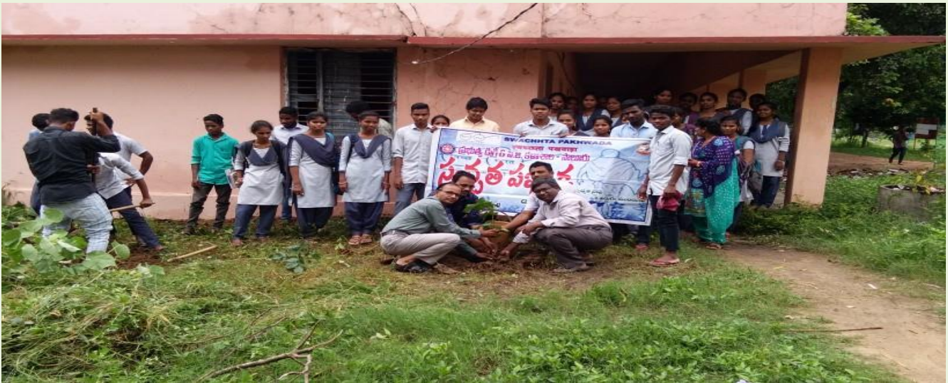
Swachhata Pakhwada Programme Conducted on Salur 14.08.2019