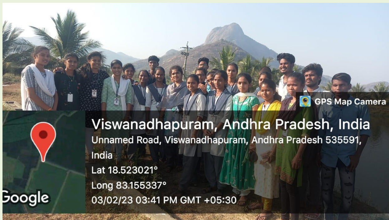
Field Visit to the fish farm at Viswanadhapuram on 03.02.23