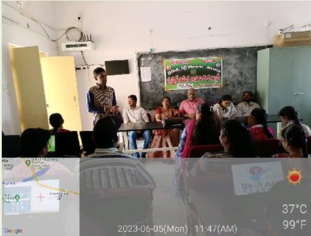
Rally Conducted “Ban On Plastics” on 05.06.23 on the occasion of World Environment Day.