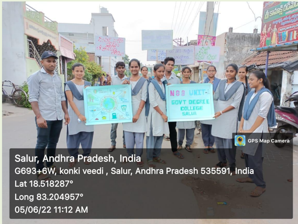
Awareness Programme on Ban On Plastics conducted on 05/06/2022.